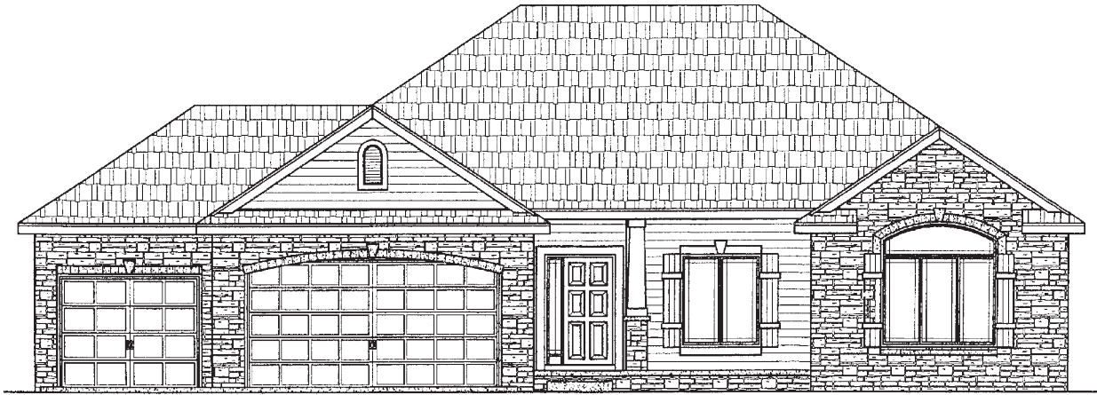
Floor Plan - 2051 Ranch