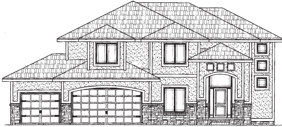
Floor Plan - 2533 Two Story